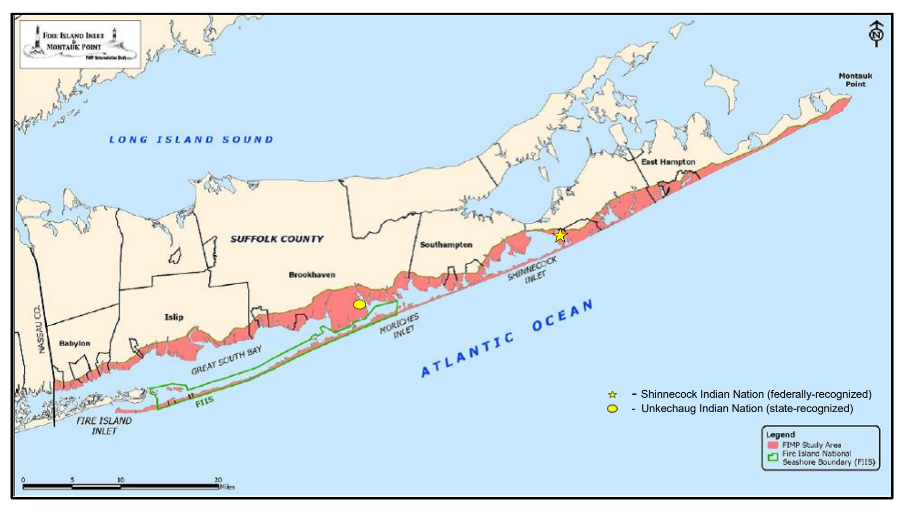
Area of Potential Effect for Fire Island to Montauk Point (not including borrow areas) and showing the location of the Fire Island National Seashore, the Shinnecock Indian Nation and the Unkechaug Indian Nation.